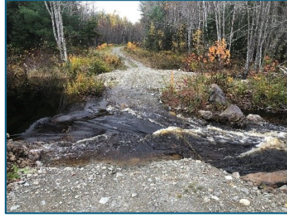
Continued rain brought even more washouts.